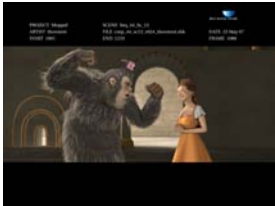
Lissi und der wilde Kaiser HerbX Film / Scanline hairstyling of Lissi and Yeti