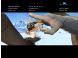
Lissi und der wilde Kaiser HerbX Film / Scanline particle simulation of flying feathers